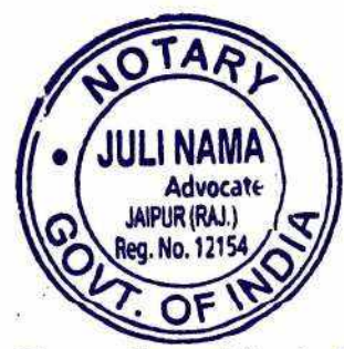
Photo Copy Attested