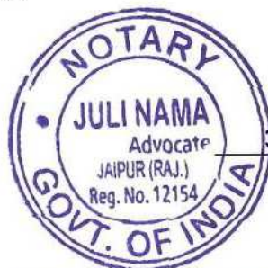
Photo Copy Attested

Less: Depreciation as per Chart u/s 32 36,80,714 36,80,714 52,92,810