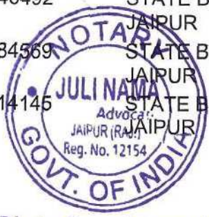
Photo Copy Attested

NOTARY PUBLIC JAIPUR (INDIA) 27 AUG 2025