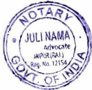
Photo Copy Attested