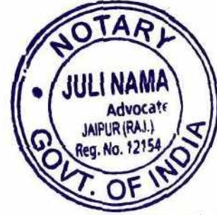
Photo Copy Attested