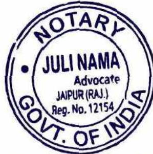
Photo Copy Attested

Sr. No. Address 1 E-145, RIICO INDUSTRIAL AREA, BAGRU EXT PHASE-II, BAGRU JAIPUR, Jaipur, Rajasthan, 303007